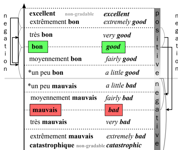
Figure 2: Our model of negation and graduation

Figure 2 describes how negation acts on force and polarity of a word or expression. Our model of negation is inspired by French linguists (Charaudeau (1992), Muller (1991), etc.). We chose to present this model with the opposite pair bon “good” ↔ mauvais “bad”, because the antonymy relation characterizes most gradable words, placing them on a scale of values from a negative extremity to a positive one.